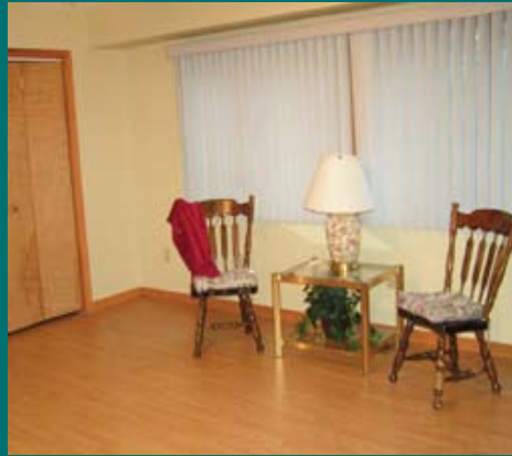
Office Or Living Room