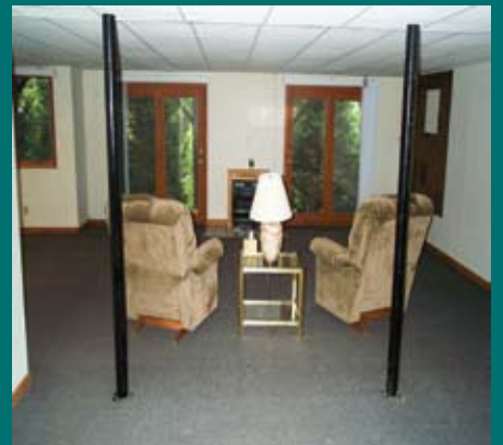
1/3 of Recreation Area

Excellent Heat & Air Units, Automatic Generator, Gas Log Fireplaces, 3 Double