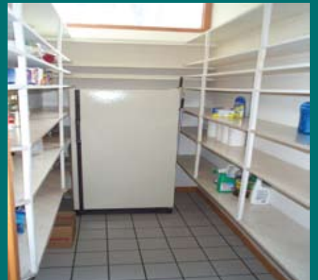
Freezer in Pantry

4300 Sq. Ft. 4 Bedrooms, 4 Baths, Great Room, Office/Formal Living Room, Dining Room, Large Kitchen, Full Rear Deck, Gardens, & Mountain Views