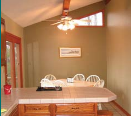
Breakfast Mtn. View