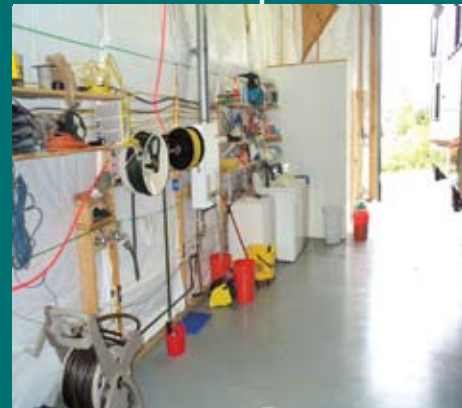
Air Line, Wash/Dry, Bath

Yes you can live in the mountains & store your RV in a heat & air insulated