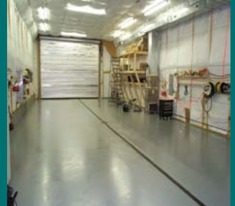
75 x 30 Ft. HVAC Shed