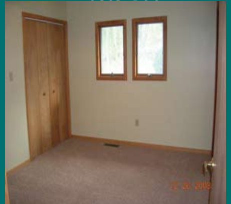
Guest Room 2