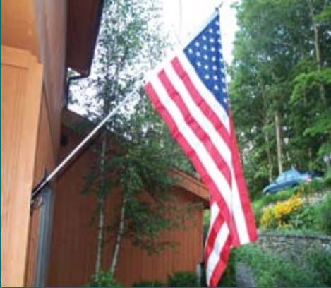
Flag & Rock Wall