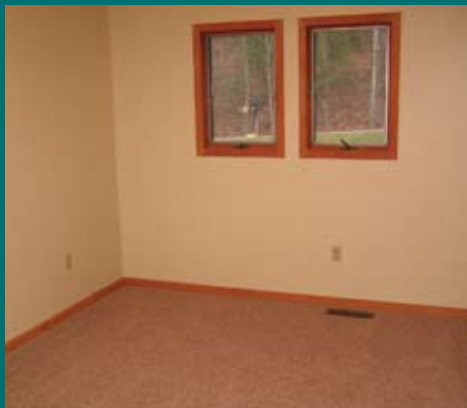
Guest Room 3