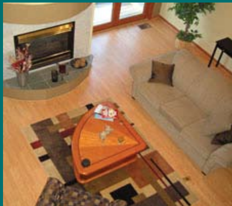
Great Room Overview