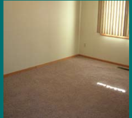
Guest Room 1