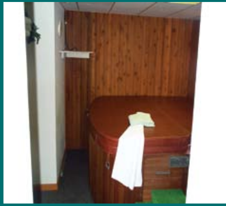
4 Person Jacuzzi