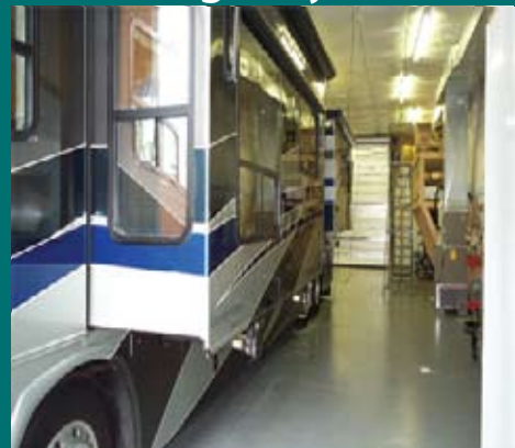
Power & Water Hookup