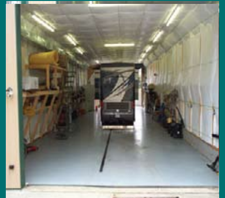
Room For Tow Car