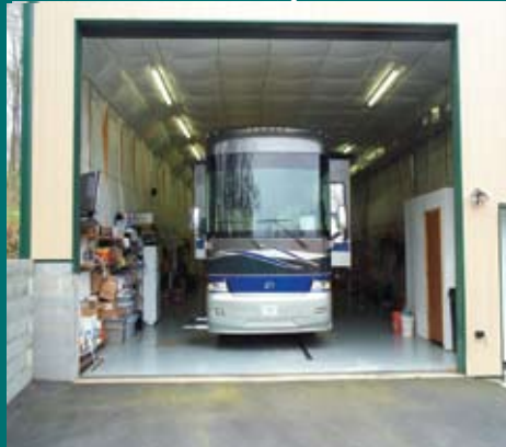
Room For Open Slides