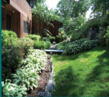
Garden & Rock Walls