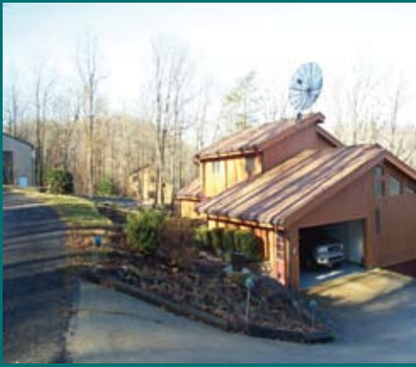
Long Shot of Both Lots