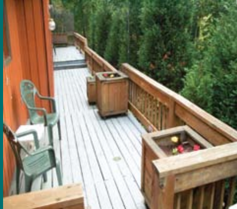
The Long Deck